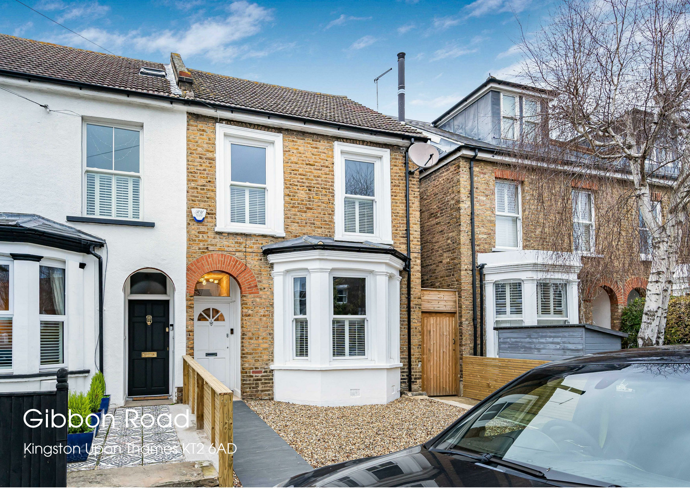
Gibbon Road Kingston upon Thames KT2 6AD